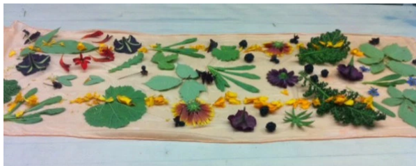
raw materials on a silk scarf